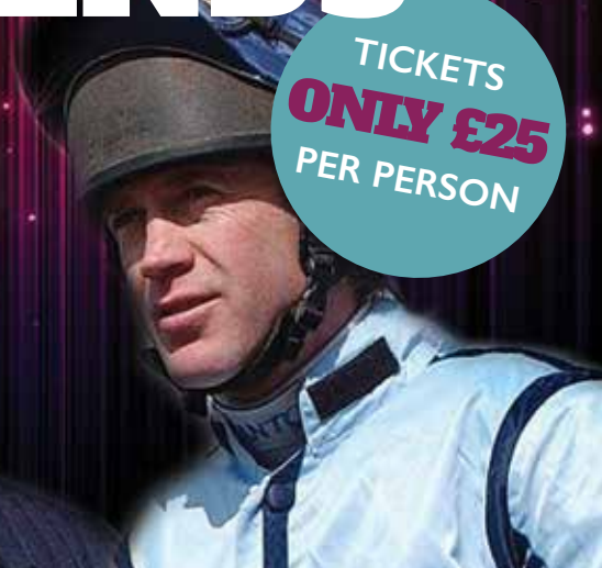
CARL LLEWELLYN Dual Grand National Winner

INTERVIEWED BY RACING CORRESPONDENT JONATHAN POWELL